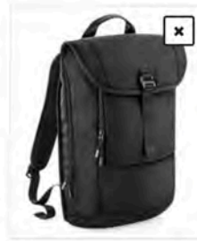
QD560 Onesize Pitch Black 12-Hour Daypack

QD565 Pitch black 24 hour backpack FROM £45.95