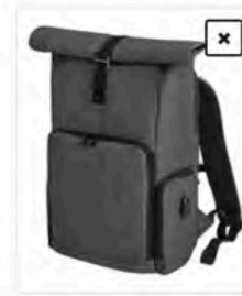
QD995 Onesize Q-Tech Charge Roll-Top Backpack

QD925 Project charge security backpack FROM £59.95