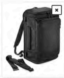
QD568 Onesize Pitch Black 72 Hour Weekender

Alongside the external access padded laptop compartment and quick access end pockets, the pitch black 72 hour weekender has an innovative strap system that quickly converts the bag from backpack to shoulder bag. Built for purpose, the travel bag is ready for global business trips, everyday commutes and long haul journeys.