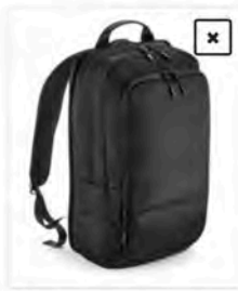
QD565 Onesize Pitch Black 24 Hour Backpack

QD568 Pitch black 72 hour weekender FROM £55.95