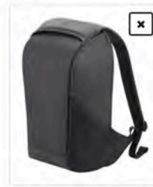
QD925 Onesize Project Charge Security Backpack

QD560 Pitch black 12-hour daypack FROM £39.95